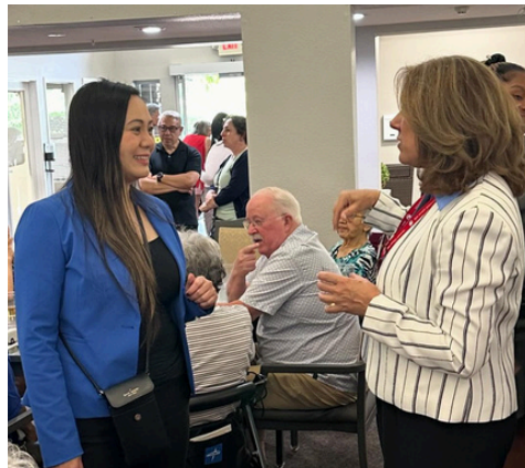
Celebrating the 10th Anniversary of the ACC Greenhaven Terrace! I was privileged to acknowledge the commitment and service provided to our senior community. Your exceptional care for our loved ones is truly appreciated!