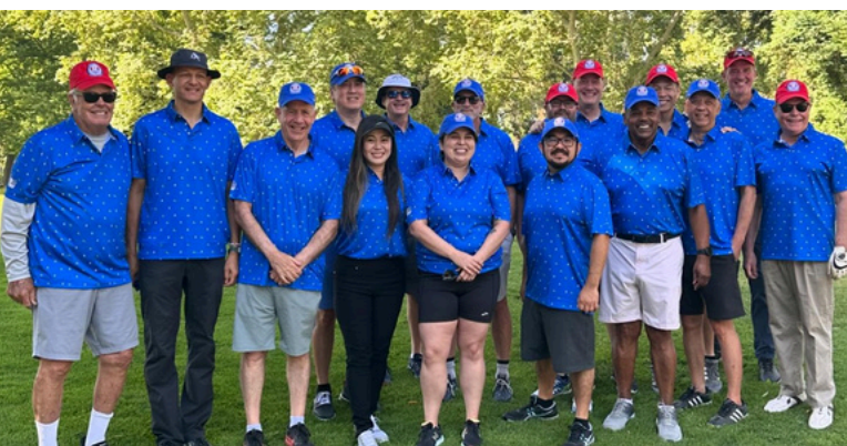
Attended the 5th Annual Capital Cup Challenge to commemorate the 100th anniversary of the William Land Golf Course and support the Morton Golf Youth Program.