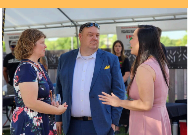
I had an amazing time at the 7th annual Bounty on the Boulevard, benefiting the Elk Grove Regional Scholarship Foundation! This event raises money for college scholarships distributed to local students each year. It showcases the strength of community and emphasizes the significance of investing in our next generation.