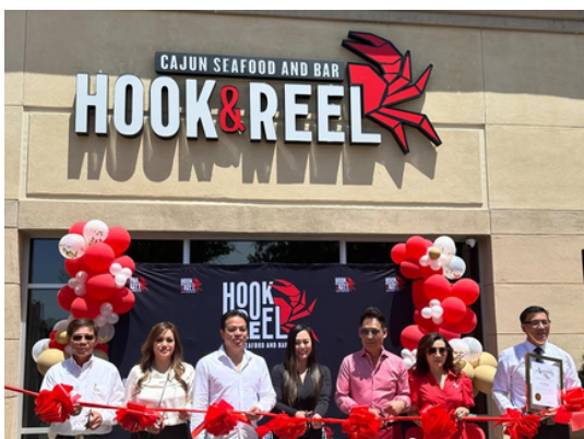
Ribbon cutting and grand opening for the first West Coast location of Hook & Reel! Congratulations to the entire team for this exciting moment. Here's to many successful years ahead at this new location!