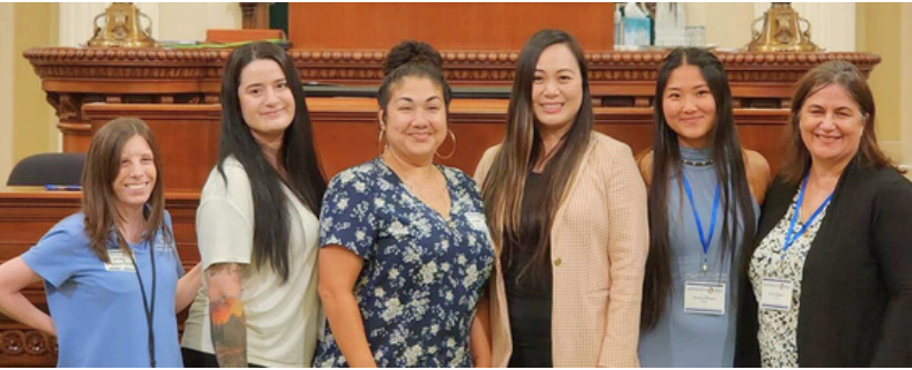
The Sacramento Family Justice Center received recognition on the Assembly Floor, and I am proud to be a co-author of ACR 194. Serving as a pillar of the community, they provide unwavering support to abuse victims and advocate for justice tirelessly.