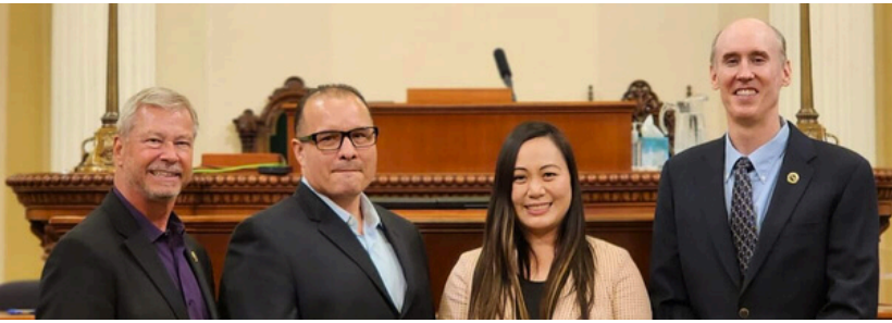
The Half Dome Team from Franklin High School was warmly welcomed for their outstanding accomplishments in cybersecurity, becoming the first Northern CA team to secure victory in the Air Force Association CyberPatriot National Competition and winning their fourth consecutive win in the NorCal Cyber Majors Cup. It was a privilege to host them at the Capitol.