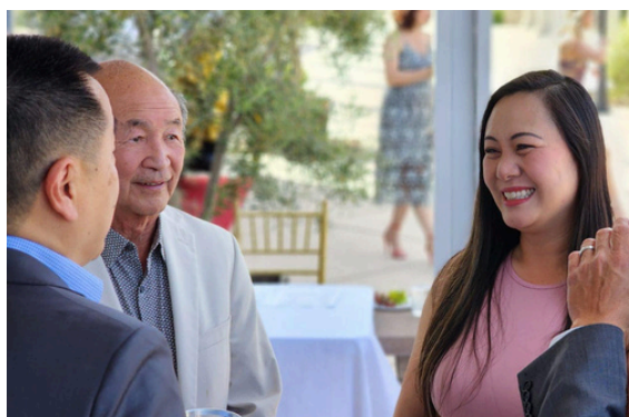
The Conference of Asian American Professionals (CAAPS) has advocated for and provided resources to API-owned businesses for the last 16 years. I had the privilege to attend their Red Carpet Awards Gala to recognize this year's recipients for their outstanding work in the API community.