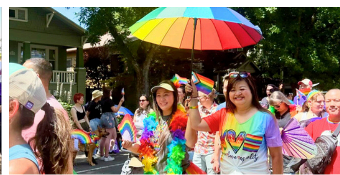
Celebrating love in Sacramento! Attended the Pride Parade and had an amazing time. The vibrant event showcased the creativity of Sacramento's LGBTQ+ community. People of all ages and backgrounds came together to celebrate not only love, but acceptance and the strength found in solidarity. It was a day to remember - a testament to the power of love and the beauty of coming together in celebration.