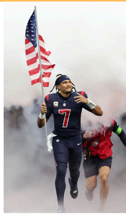
Such a pleasure to welcome NFL Houston Texans QB, C.J. Stroud, to the Assembly floor. Thank you for representing California and your continued efforts to advocate for communities and families. Congratulations on all of your achievements so far!